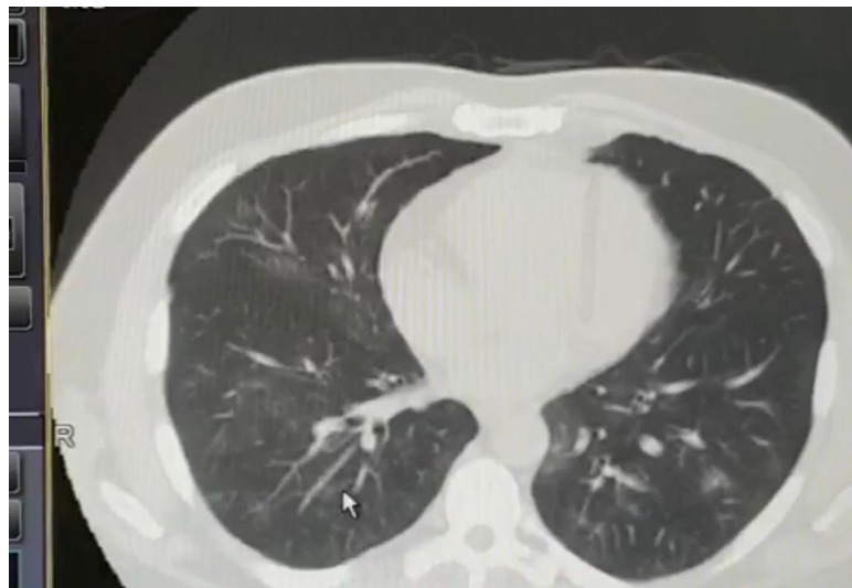
Figure 2. The patient's CT scan after seven days of the treatment with heparin and antiviral medications

Because the patient was in the third trimester and had a history of preterm labor, fetal and placental health were monitored weekly with a biophysical profile test. A CT scan of the lung was again requested for the patient four weeks after discontinuing antiviral treatment. The results of radiological tests were normal (Figure 2). Due to the patient's stable condition, she was referred to the gynecology ward to continue prenatal care. Complete monitoring of the patient during labor, delivery, and postpartum was strongly recommended to prevent other morbidity and mortality (12).