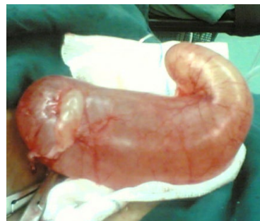
Figure 2. Macroscopic appearance of primary tubo-ovarian hydatid cyst

lesion in the left adnexa, which was hypo- to hyperdense with peripheral contrast enhancement (Figure. 1). Preoperative routine laboratory tests and chest radiographs showed normal results. Also, all tumor markers were negative. The patient underwent laparotomy with left adnexectomy, peritoneal cytology, and biopsies. No ascites was noted at operation, and other abdominal and pelvic organs were normal. The left fallopian tube and ovary were found as a cystic mass and were resected with the appearance of a tubo-ovarian abscess (Figure. 2).